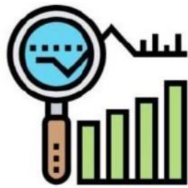
Complaint Trend Analysis