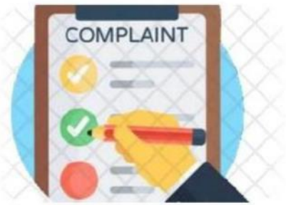
8D Status Tracking Dashboard