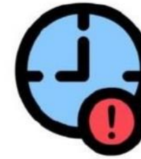
Pending Actions Analysis